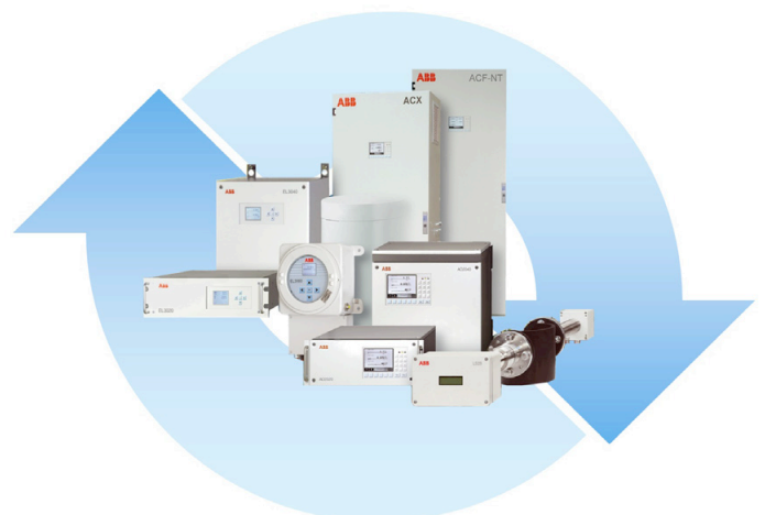
ABB provides all major international certificates for CEMS, hazardous area installations, metrological approvals, electrical safety and quality and environmental management.